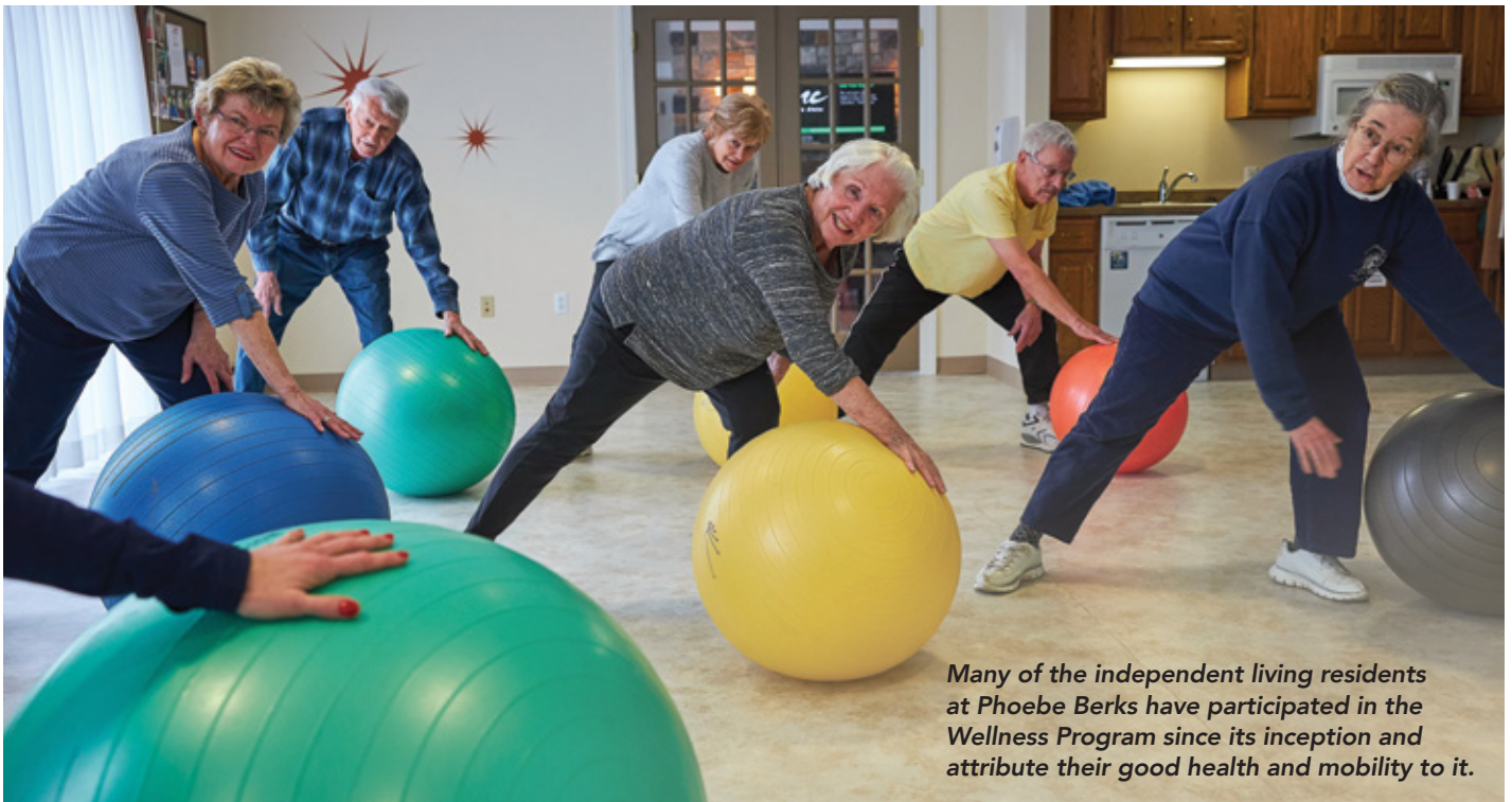
Many of the independent living residents at Phoebe Berks have participated in the Wellness Program since its inception and attribute their good health and mobility to it.