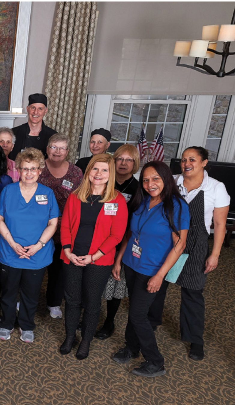
Employees who have worked at Phoebe Allentown for 20 or more years pose for a group photo in the Health Care Center parlor.