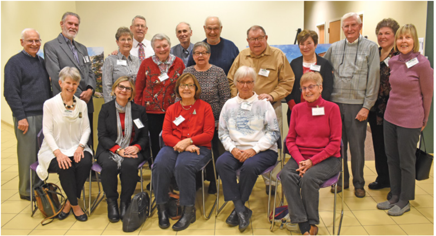
A group of Chestnut Ridge depositors gathered for a photo at the Chestnut Cheers holiday event on December 5.