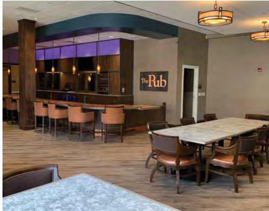
Perhaps the most exciting addition to Phoebe Berks is the Pub. Here, residents can relax before their dinner in Bistro 422, or enjoy more classic tavern fare with a cold brew or glass of wine. Close to the pool table and game room across the hall, the much-anticipated Pub will be a hub of activity for Berks residents.

Construction officially wrapped in early summer, but, due to COVID-19, group activities and events have been limited for resident and staff safety. Even with protocols in place, residents and staff are thrilled with