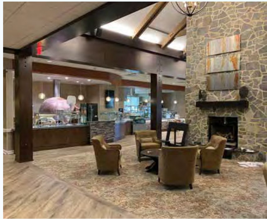
Bistro 422 replaces the previous dining room. The new restaurant features daily specials, a casual, warm ambiance, and plenty of room to invite friends and family for dinner.