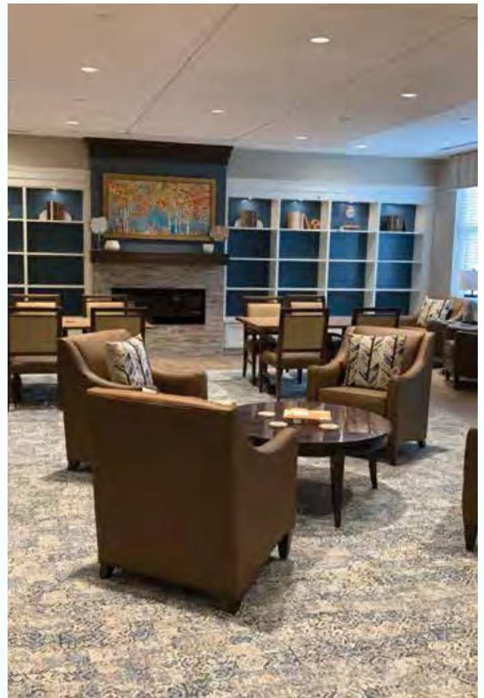
Lounge spaces throughout the Community Center allow for spontaneous meet ups, as well as communal space for clubs and groups to get together.