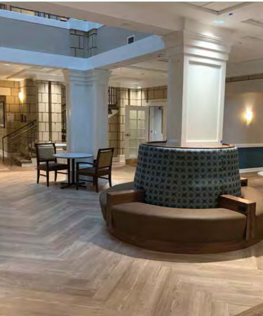
The main entrance to the Grant Harrity Community Center is now open and warm. There are comfortable seating options for residents, families, and friends who frequent this space on a daily basis.

Phoebe Berks Village just completed a $7.5M renovation of the Grant Harrity Community Center. This reimagining of the Community Center introduces new amenities for Phoebe Berks residents, encouraging them to live their best retirement lives with us!